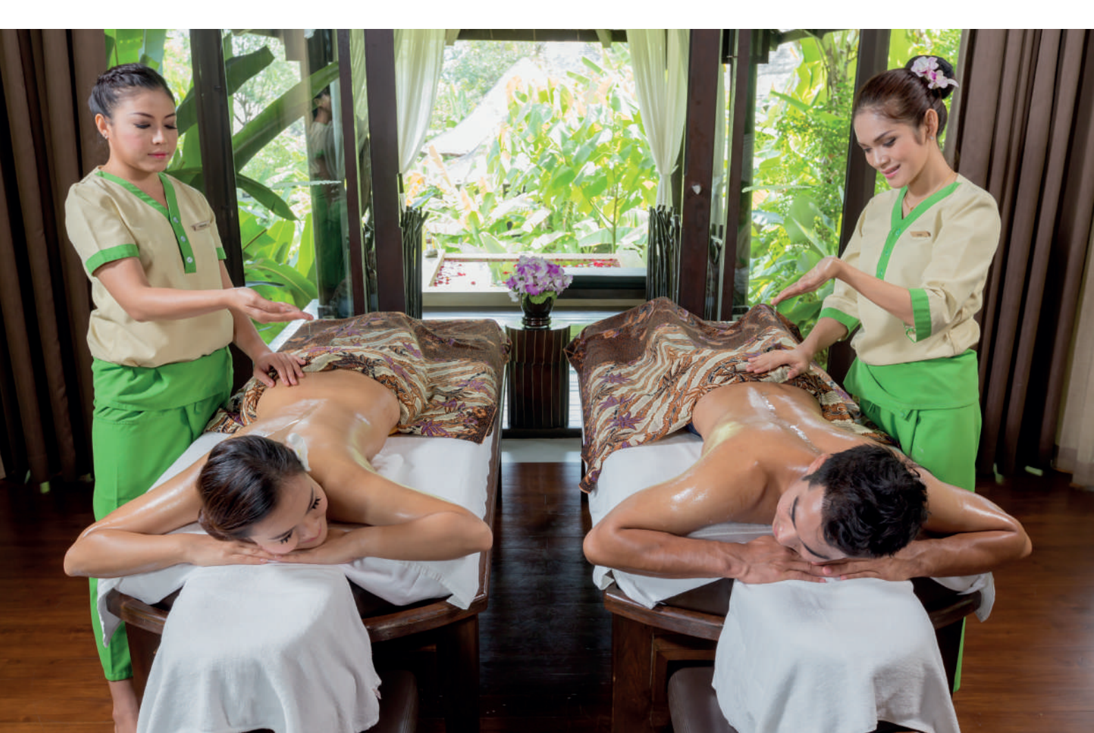
All prices are inclusive of 10% service charge and 7% government tax.